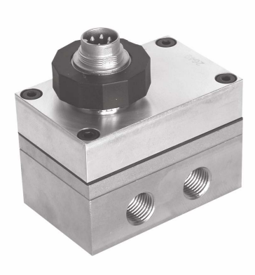
Medium pressure type