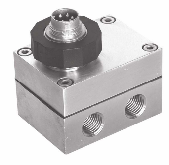
Low pressure type

So that the differential pressure can also be measured exactly if the standard pressure range/differential pressure ratio is high, this series also features the tried-and-tested microprocessor-based technology that is used in Series 30 X. All reproducible pressure sensor errors (i.e. non-linearities and temperature dependencies) are entirely eliminated thanks to mathematical error compensation. The sensor signals are measured with a 16-bit A/D converter, so the individual standard pressure ranges can be measured to an accuracy of 0,05%FS throughout the entire pressure and temperature range.